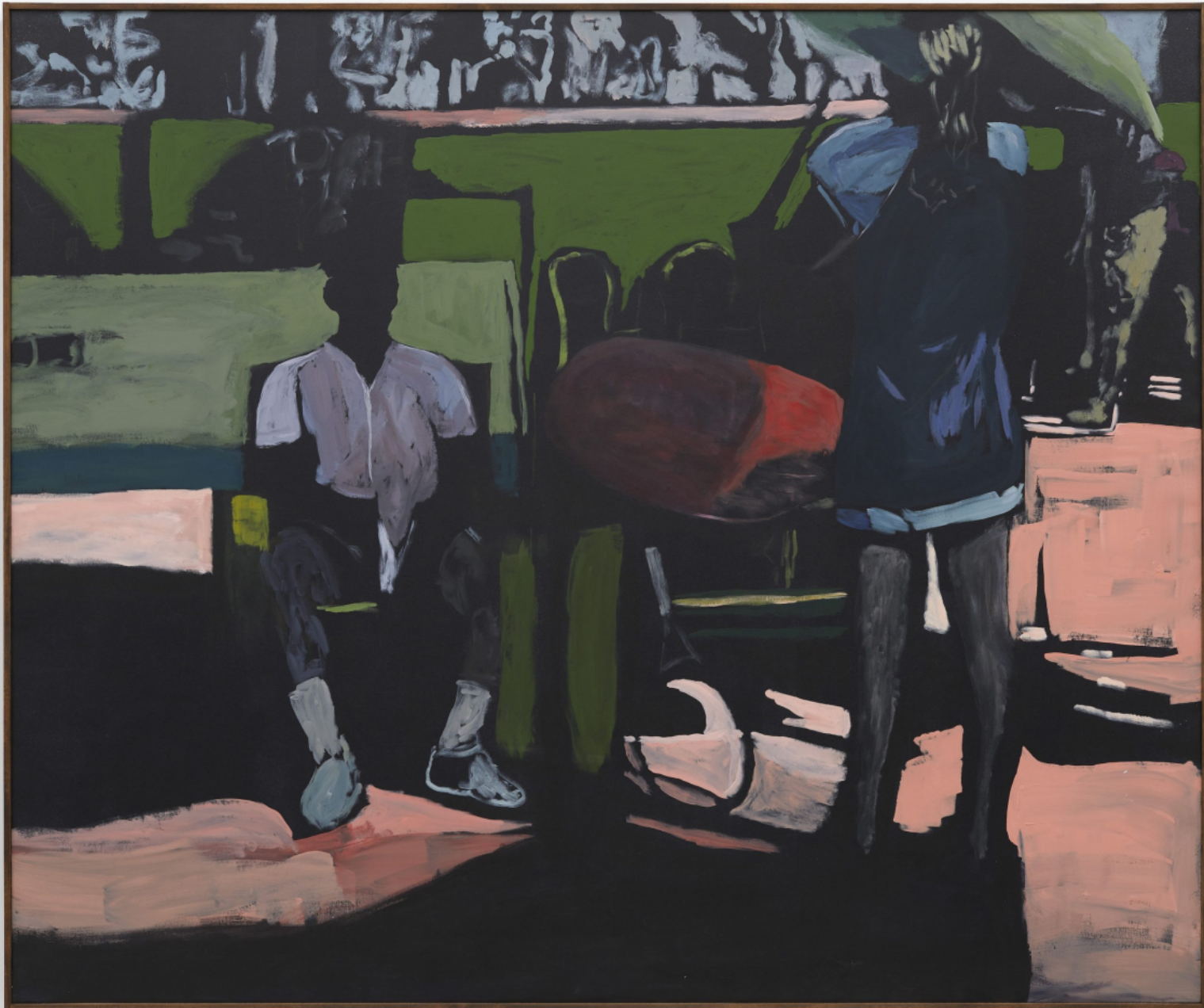
Reggie Burrows Hodges, "For the Greater Good: White Ground" (2019) acrylic and pastel on canvas, 80 x 96 inches (image courtesy the artist and Karma, New York)