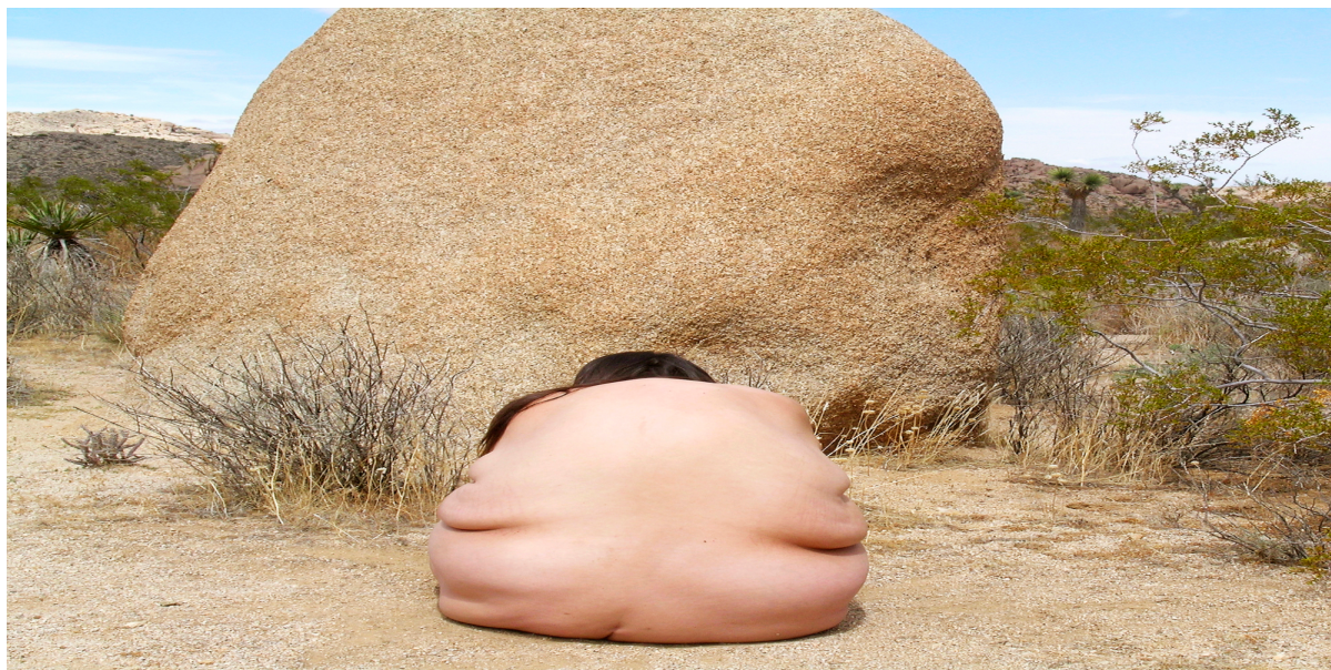
Laura Aguilar, "Grounded #111" (2006), inkjet print, 14 1_2 x 15 inches (© Laura Aguilar ; image courtesy Leslie-Lohman Museum of Art)