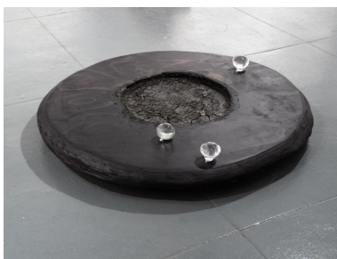
JILL COHEN-NUÑEZ well As part of the installation wait in the garden 2020 Maple plywood, glass Dimensions variable