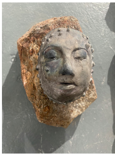
JILL COHEN-NUÑEZ untitled (guardian) 2 As part of the installation wait in the garden 2023/2024 Raku stoneware, stone Dimensions variable