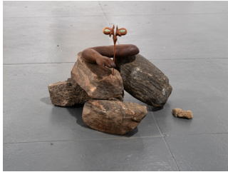
JILL COHEN-NUÑEZ untitled As part of the installation wait in the garden 2024 Walnut, redwood, soapstone, stone Dimensions variable