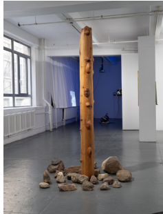
JILL COHEN-NUÑEZ altar beam As part of the installation wait in the garden 2023/2024 Cedar wood, cherry wood, stone Dimensions variable