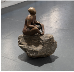
JILL COHEN-NUÑEZ of: a guardian As part of the installation wait in the garden 2020/2024 Bronze, stone Dimensions variable